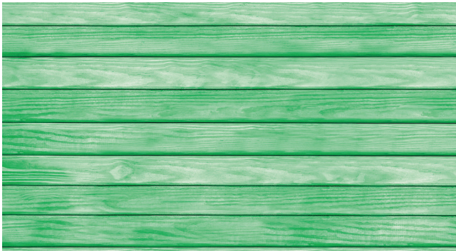
FrameGuard Coated Wood