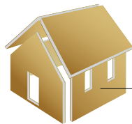
Premier SIPs Building