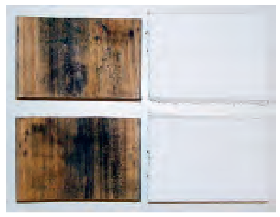
Southern Yellow Pine with Mold Growth